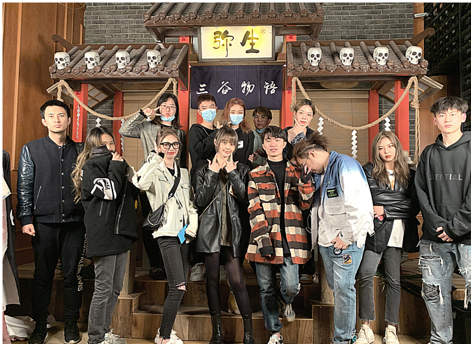
Everyone Escaped Room successfully