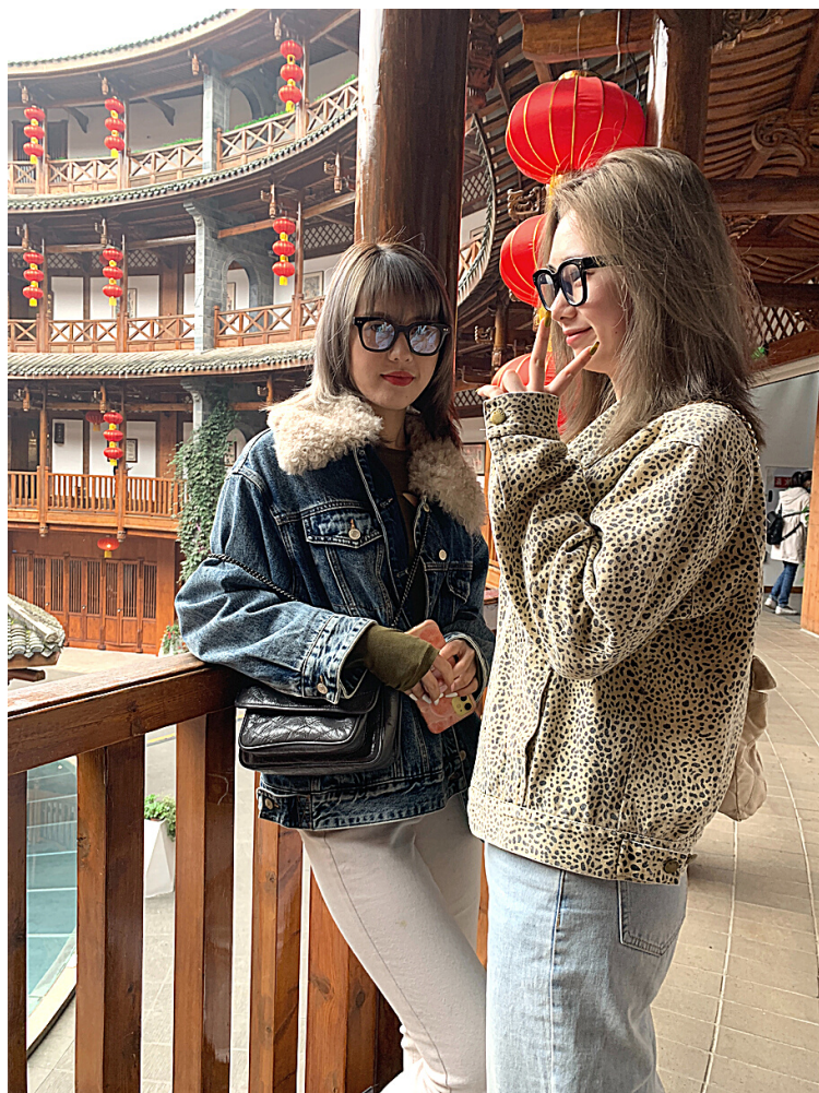
Explored a Hakka Earthen Building