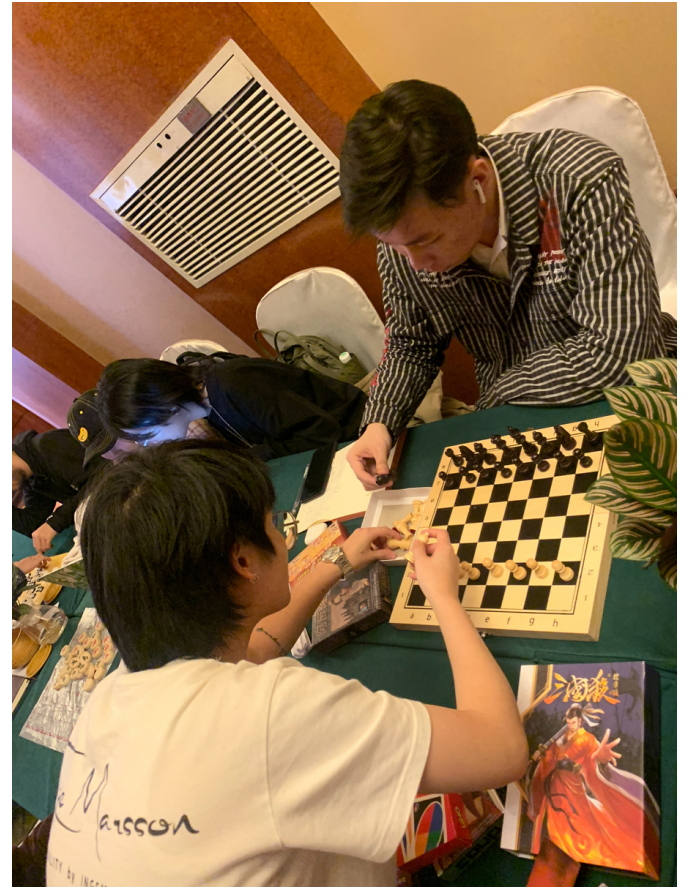
Chess Game! Guess who won?