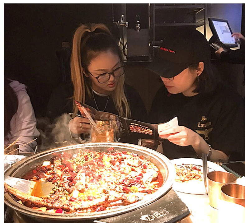
First food tour organized by the Student Foodie Squad

By committing to international education, missions of G-MEO are not only to offer high quality academics but also to build a learning community with rich, diversified, and fun extracurricular activities for students to entertain, relax, and make new friends. In addition to the weekly activities planned on the calendar, cards, chess, and other board games are set in the lounge area; student interest groups are also formed.