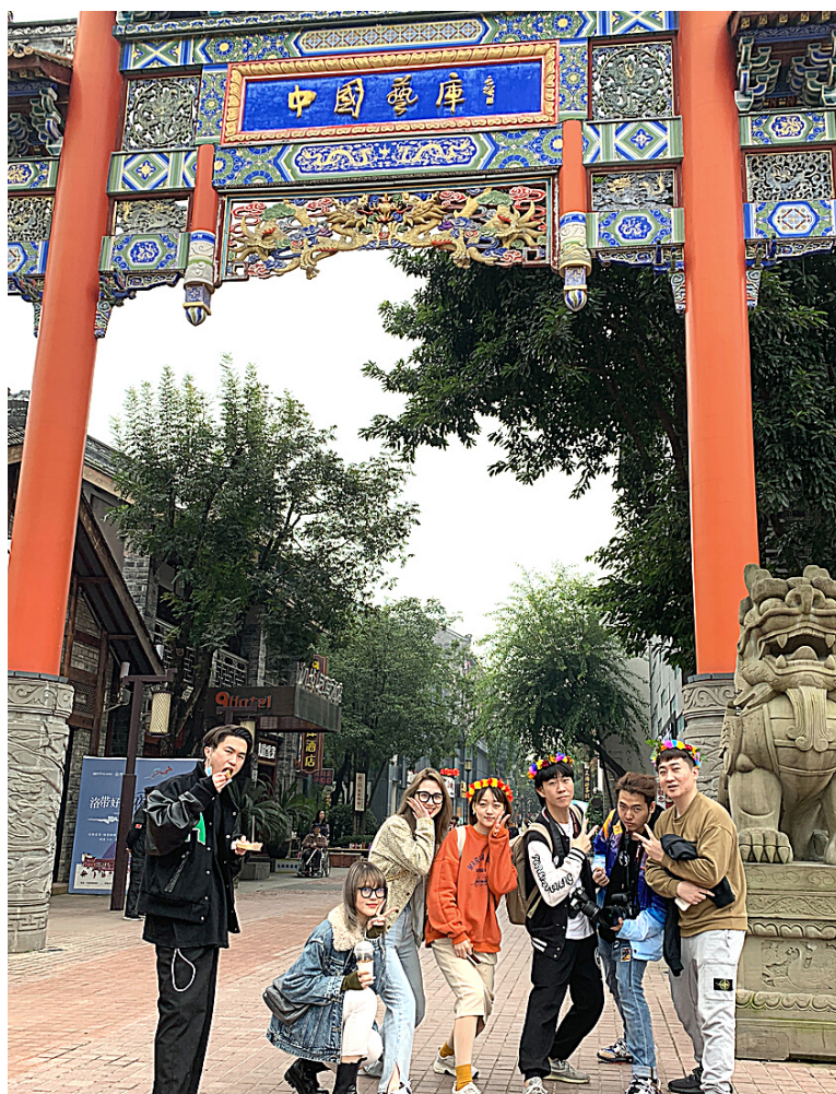
Small group, big fun!