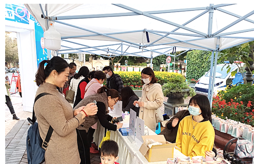
A busy and lively festival