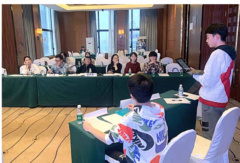
Thanks to the Review Board!

Last Wednesday afternoon, the Student Debate Club held the first round of the G-MEO Fall 2020 Student Debate Competition. The topic was "is it more lamentable to lose after gaining or never to own?" Before the debate, both teams had been collecting ideas and evidence to support their points. The fierce and exciting debate trained our students' minds, showed their critical thinking skills, and inspired the audience. The Review Board executed their rights by giving comments and grading. All the attendees spoke highly of the debaters' performance.