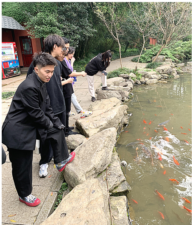
Feed fishes, make wishes