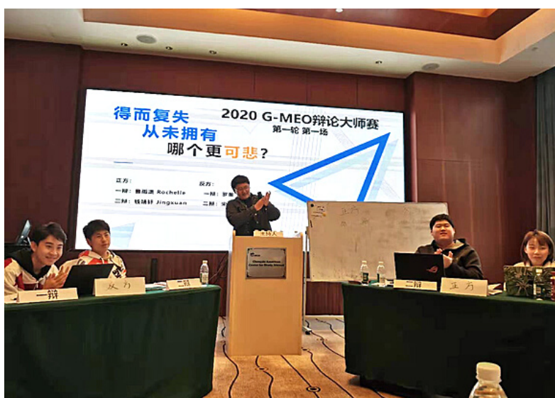
An interesting topic, good debaters!