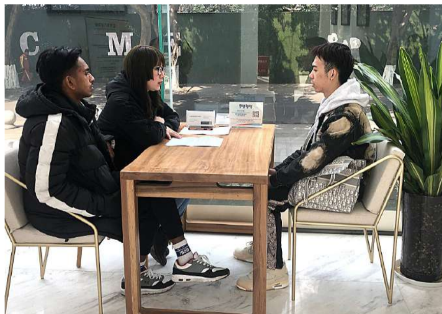
Students being interviewed at a community service center

Sweets make people happy! Last Thursday afternoon, the Center brought dozens of cups of bubble tea to the program site so that the students could have a treat after class. All of the bubble tea was gone in just an hour and the students got to chat with each other while enjoying the various flavors!