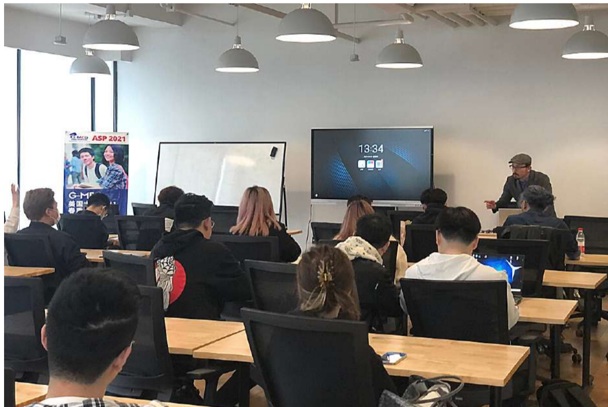
World Food and Culture class