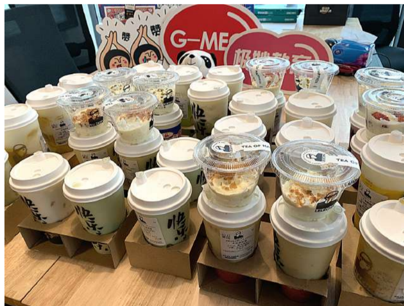
Pick your favorite flavor!