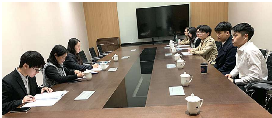
Students being interviewed at a national enterprise