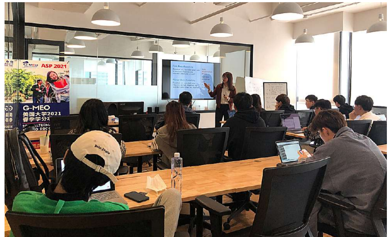
Introduction to Financial Accounting class

This Spring, the G-MEO Chengdu American Center for Study Abroad is offering twenty courses covering topics in Business, STEM, Humanities, and Internship. Students are able to choose both core courses and free electives to satisfy their academic degree requirements. They also have a chance to add and/or drop classes during the first two weeks.