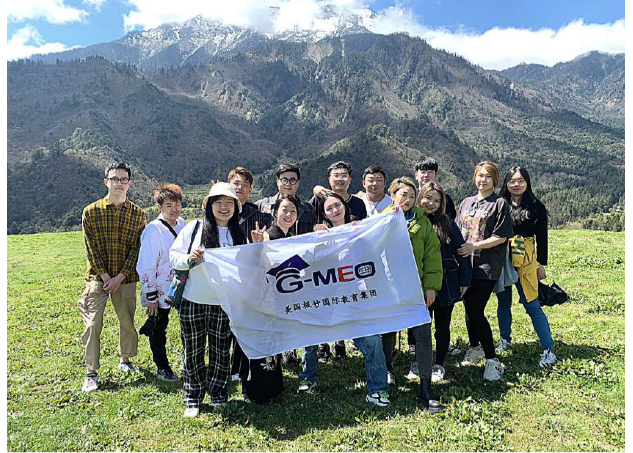
Group photo in front of a snowy mountain