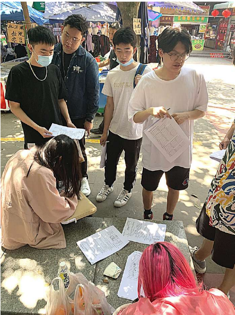
Students were finishing the scavenger hunt assignments