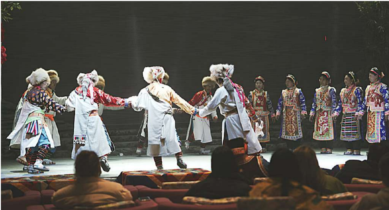
Professional performances from the Tibetan locals