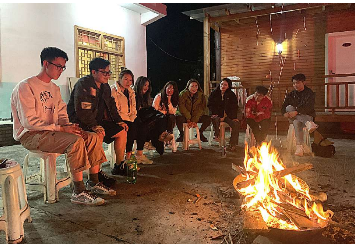
A sharing session by the bonfire after watching the performances