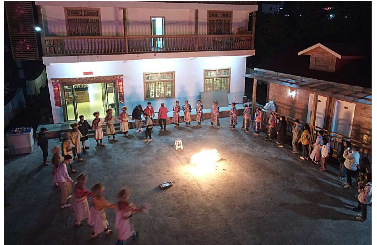
A traditional Guo Zhuang dance