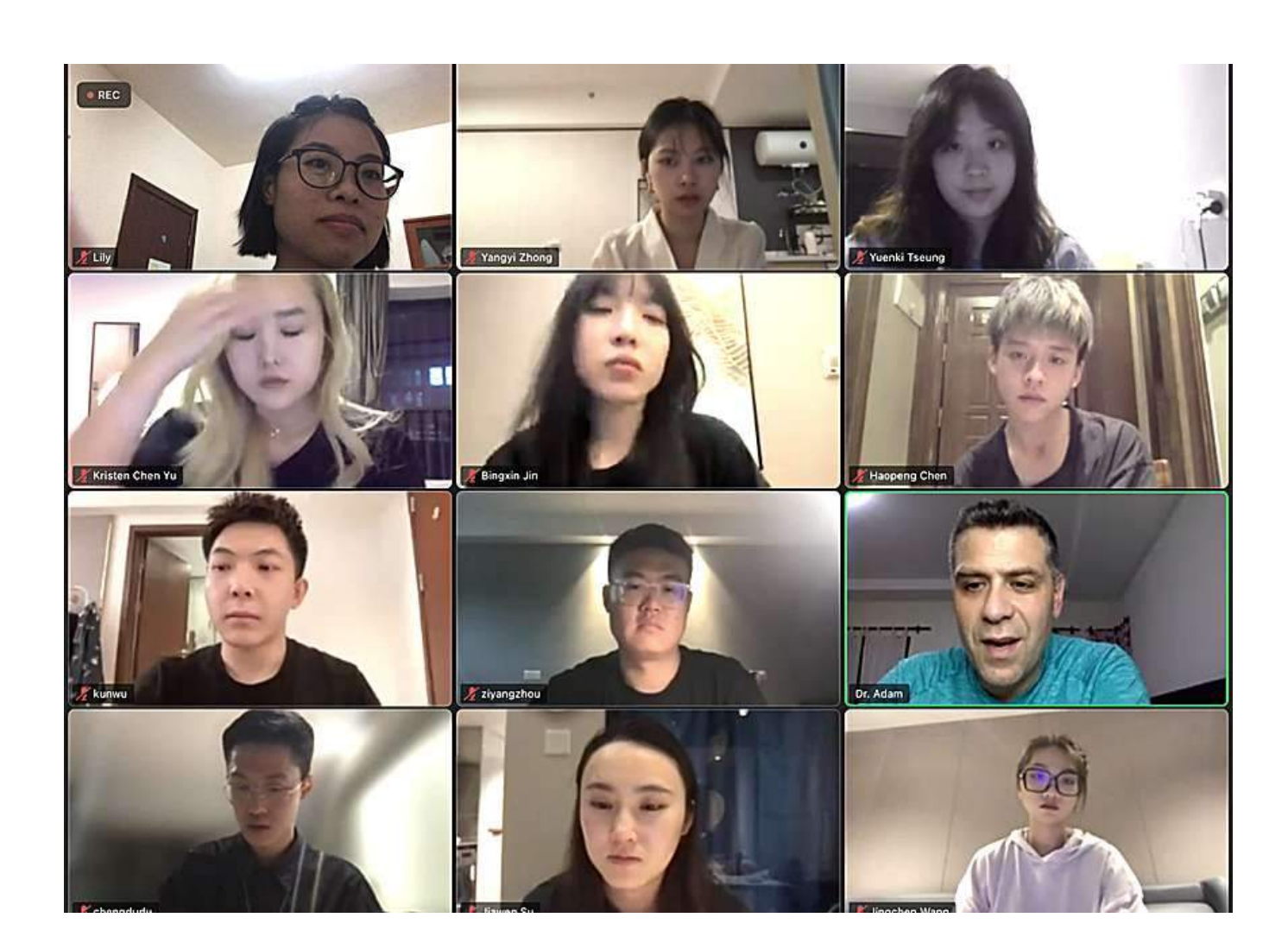
Students taking the internship course online

Since the Chengdu American Center's establishment in 2012, G-MEO's internship program has successfully hosted over 20 cohorts with hundreds of students. This program enhances students' Chengdu experience and provides them with the chance to gain skills that today's employers are looking for. After the outbreak of COVID-19, G-MEO's internship program continued to benefit Chinese students from U.S. universities who were unable to return to the US from China. In the Fall semester of 2021, 9 students took the Professional Development and Experiential Learning in China course, and interned at six different companies or institutions, including Aidi Eye Hospital Chengdu, Cegos Chengdu Branch Office, Chengdu Guyuan Health Consultation Co., Ltd, Chengdu Plus (Chengdu Radio and Television), DeHeng Law Offices (Chengdu), and G-MEO.