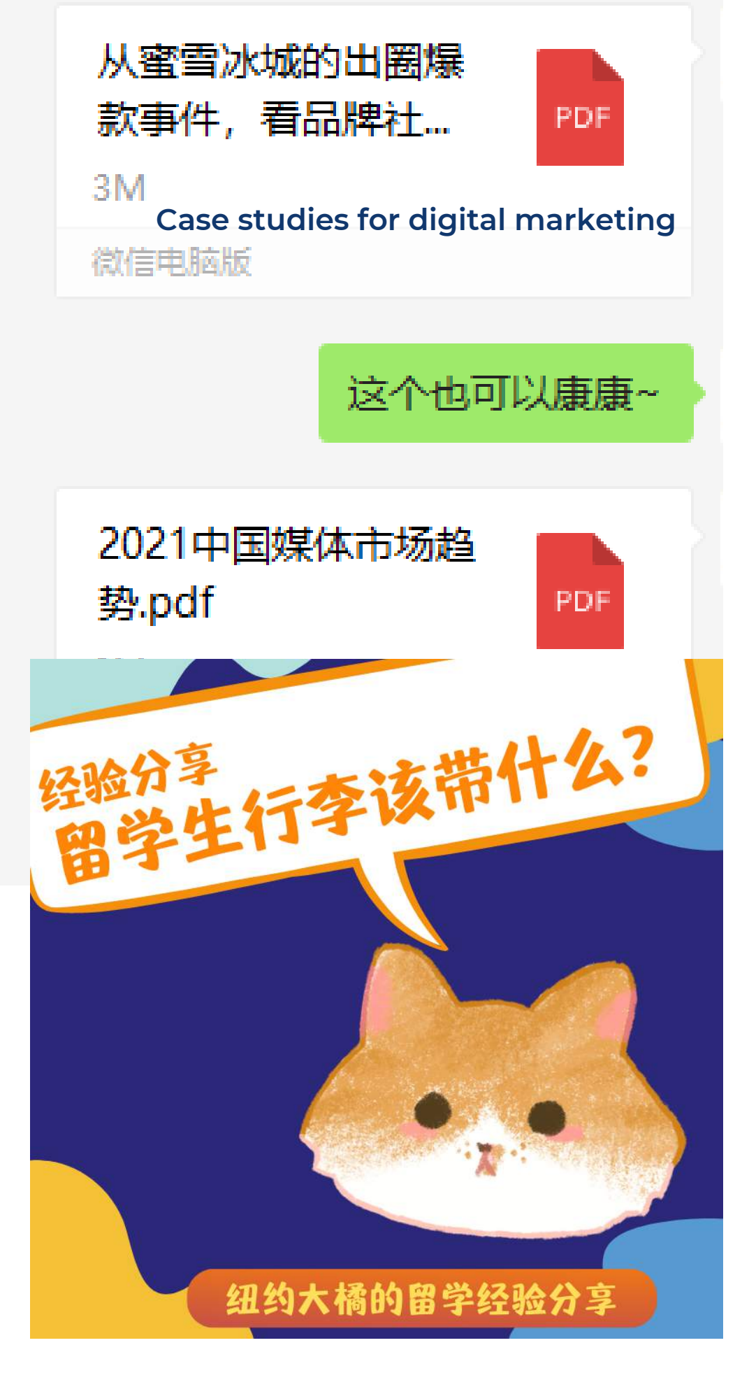
One of the students' drafts of future G-MEO WeChat posts