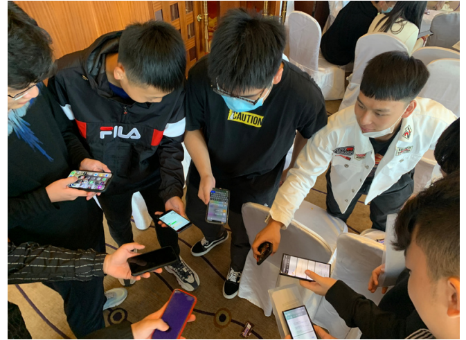
"Here is my name!"

On the Orientation Day, the students were not only introduced to the staff team and faculty members, they also got a chance to know each other. We always want students to better engage themselves in our learning community, and to establish new friendship and connections. The ice-breaker game was a competition that asked the students to memorize as many other students' names as possible. Prizes were presented to the best teams and the final winner with the strongest memory. This game brought lots of excitement, joy and fun.