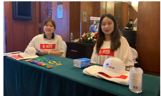
A big thank-you to student volunteers at the Orientation