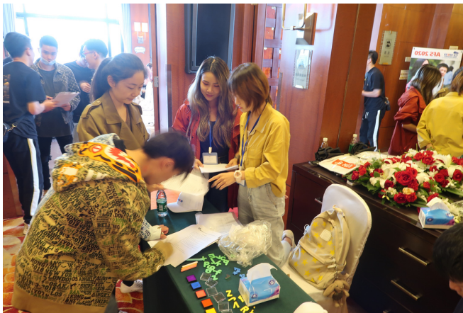
Sign-in table was ready