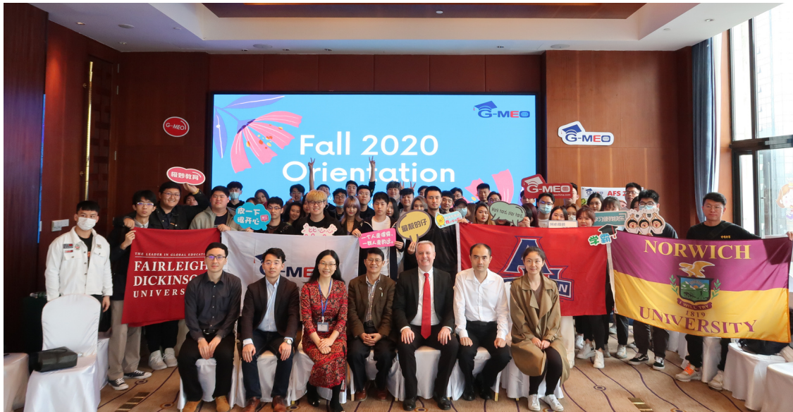
A wonderful semester kicks off!