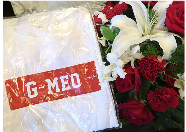
Welcome to G-MEO 2020 Fall Semester!

As unique and challenging Year 2020 is, G-MEO has been sparing no efforts in making contribution to international education. Following a great success of 2020 Summer Online Session, G-MEO has established an Alternative Fall Semester (AFS) in cooperation with Fairleigh Dickinson University, American University, Norwich University and other partner universities in the US, in order to accommodate and offer in-person class to those Chinese international students in China. This fall, the G-MEO Chengdu American Center for Study Abroad welcomes 101 Chinese international students from seven American universities. Fifteen courses covering topics from business and finance, to math and music, and some others are available.