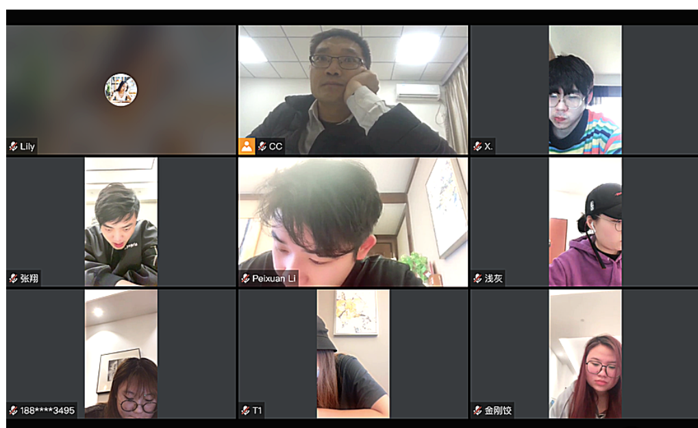
Calculus I class