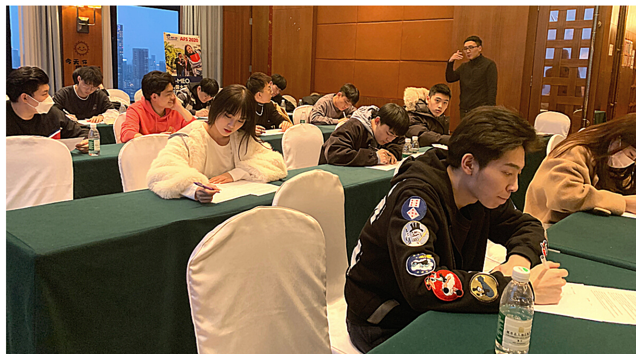
Final Exam for the Organizational Behavior class

The last couple of weeks were quickly moved online after a few new local cases of COVID were found in Chengdu. Since all the staff, faculty, and students were already familiar with online instruction, the switch was done very smoothly. An extra reading period week was given by request to faculty and students from each class before final exams. A final course evaluation survey was also sent out to collect the students' feedback on each course.