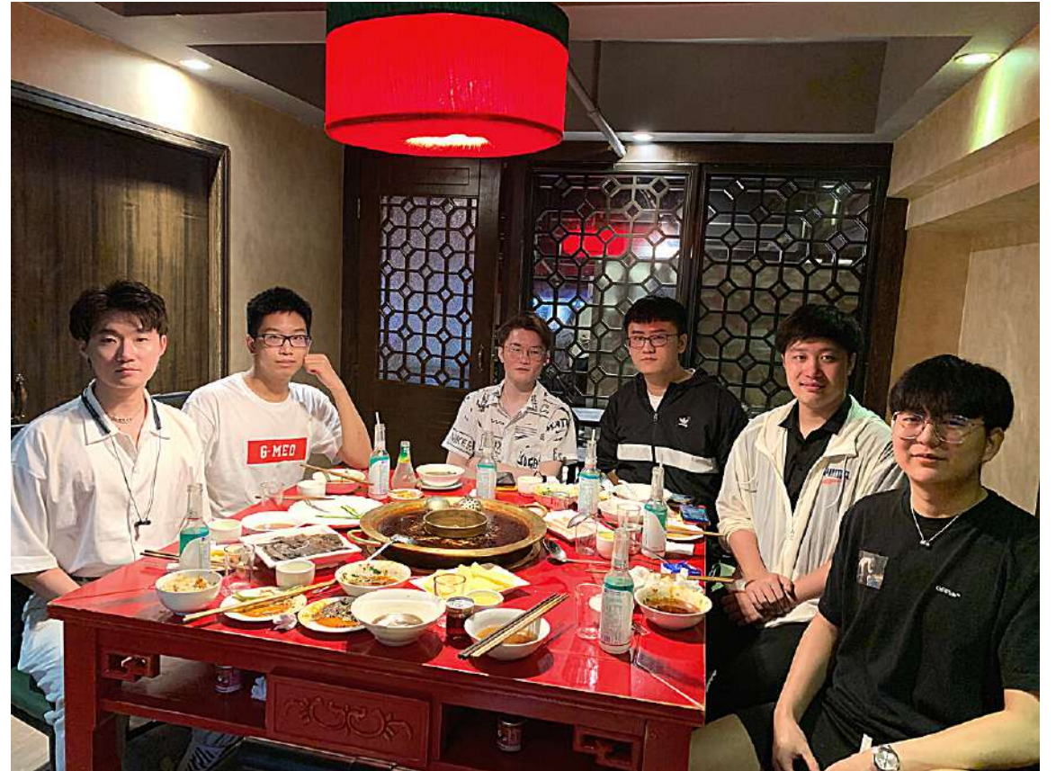
Hot Pot Welcome Dinner!