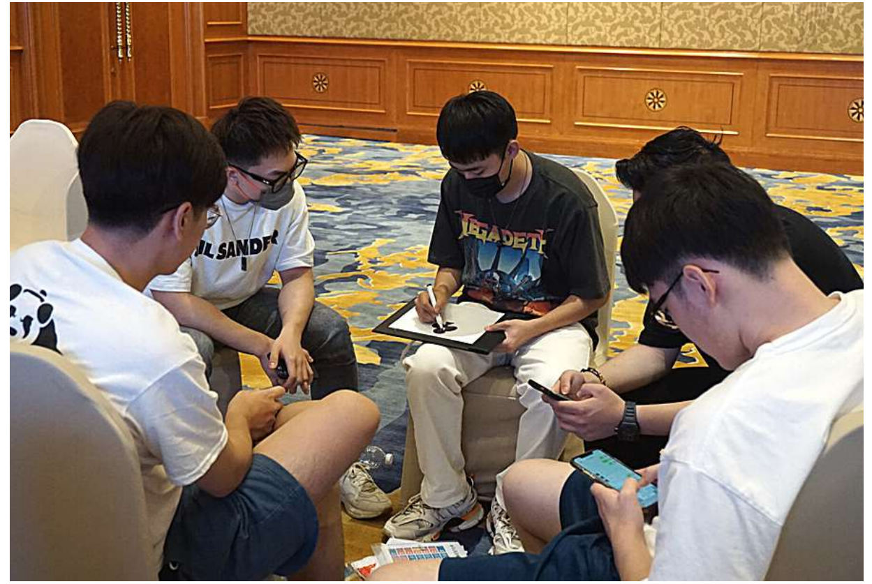
Focusing on their drawing task!