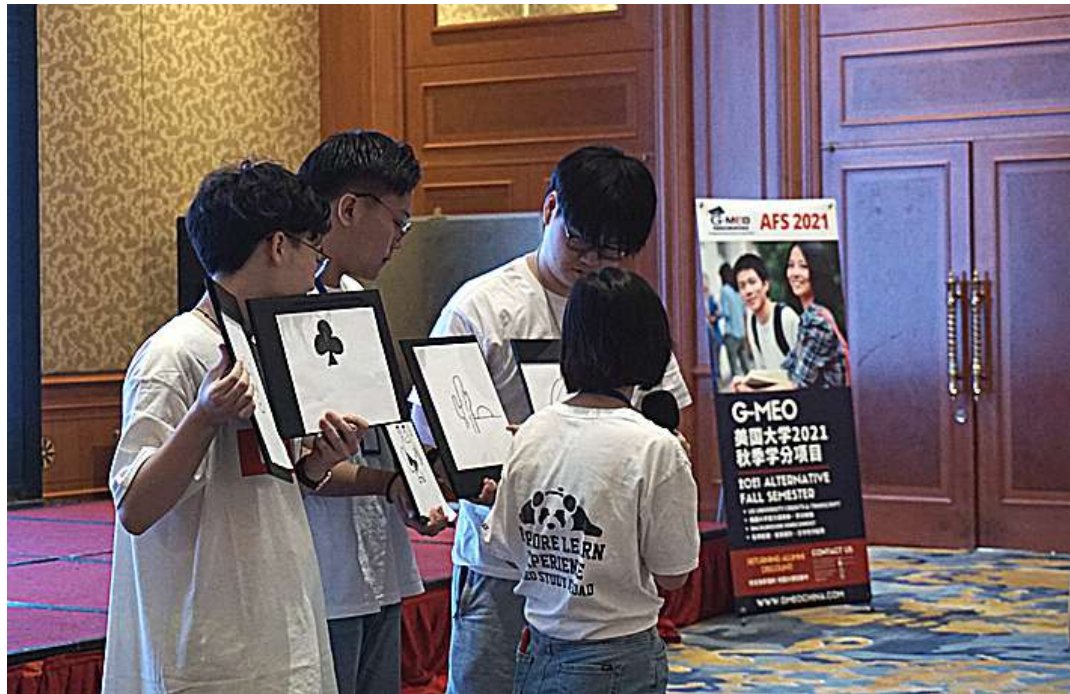
Picking out the best drawings!

Along with in-person classes, a series of fun and interesting events are also waiting for the students throughout the semester, including seminars, cultural trips, and other exciting activities. Health and safety were emphasized. The students received other information about available resources at the program site and tips on exploring Chengdu as well.