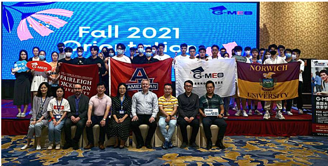
Welcome to the G-MEO 2021 Fall Semester!

During the evening on orientation day, the students gathered at a famous local hot pot restaurant to enjoy some authentic Chengdu hot pot. As most of our students come from other provinces and cities outside of Chengdu, and eating hot pot is always on the top of the to-do list if you are new here. The students really got to experience how spicy the food here is even if they just ordered slightly spicy ones. Everyone had a great time eating and socializing.