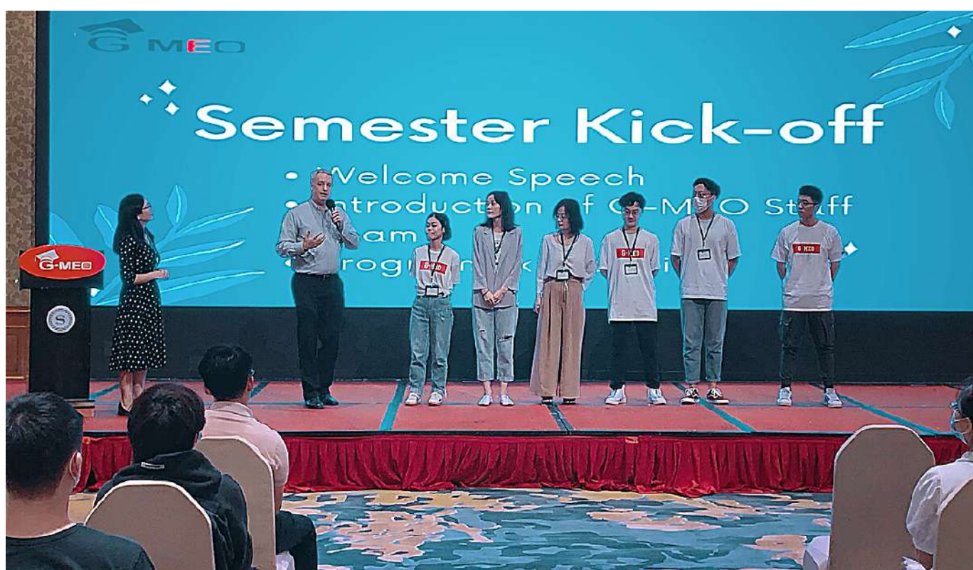
G-MEO's Chengdu Team