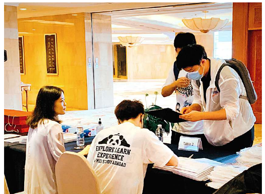
Students signing in