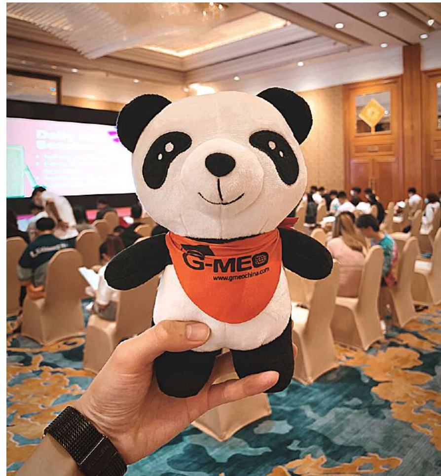
Welcome from G-PANDA!

This fall, G-MEO's Chengdu American Center for Study Abroad has welcomed sixty-six Chinese international students from five US universities: Fairleigh Dickinson University, American University, Norwich University, Stevens Institute of Technology, and University of Denver. Both in-person and online classes covering topics in Business, STEM, Humanities, and Internship are available.