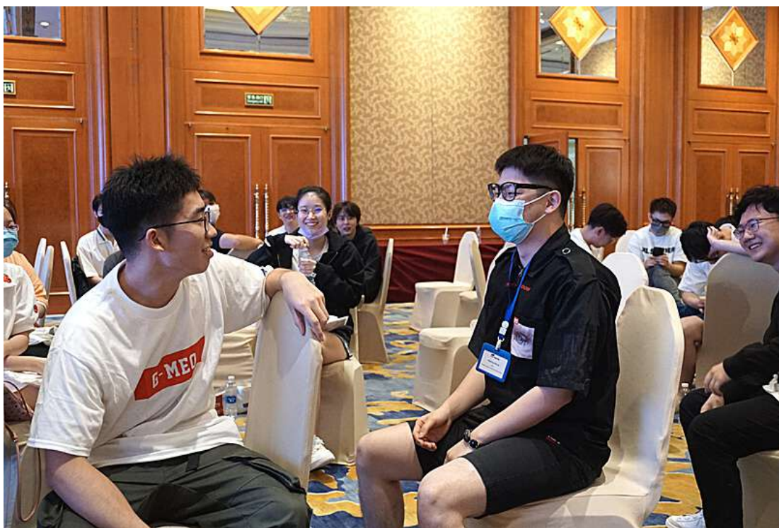
Passing on facial expressions

The last item of the orientation schedule was an icebreaker game! We planned a couple of interesting activities for students to relax and have fun. In these games, the students were asked to memorize other students' names, do quick and creative drawings, and pass on facial expressions as a team. Small gifts were awarded to the winning teams! These games not only provide opportunities for students to know more about each other but also help them develop trust and support for their team members.