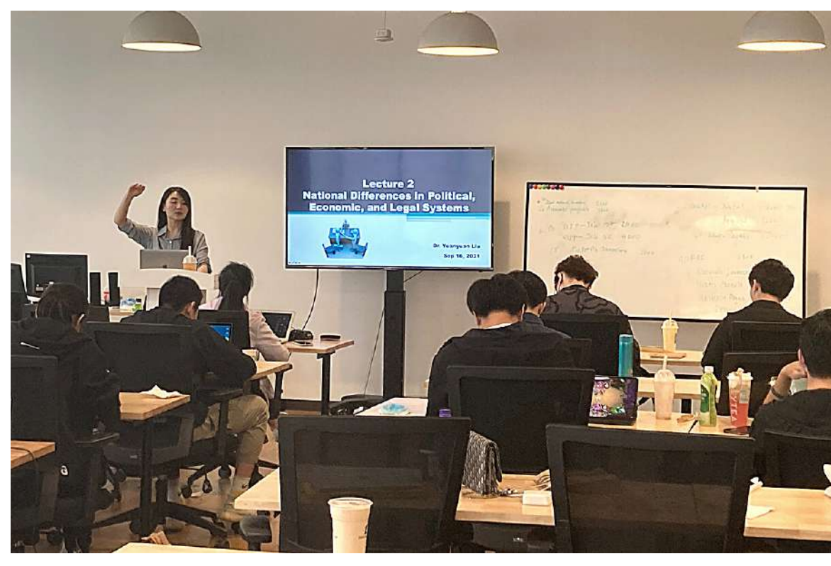
Fundamentals of International Business class