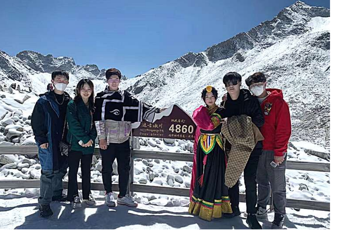
Traveling with friends. Our students are living their best lives!