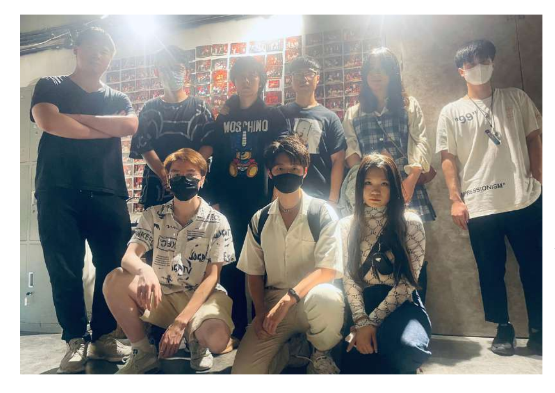
The brave boys and girls!

During the second week, we prepared dozens of cups of bubble tea with various flavors in the office. The students got to stop by the office between classes and have some sweets and refreshments! We look forward to more dessert-and-drinks days coming up this semester!