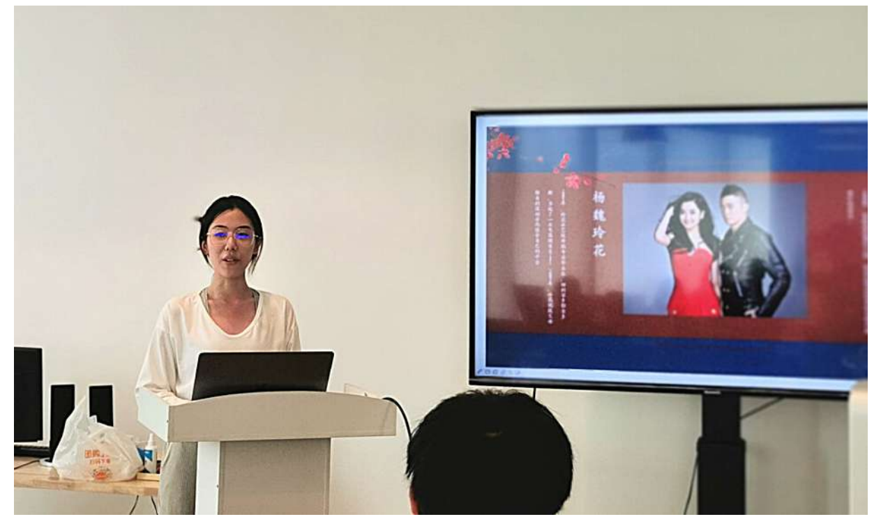
Students from World Music class giving presentations

Over the past two weeks, classes have been going smoothly at the G-MEO Chengdu American Center. Students got to adjust their course selections based on their interests and academic degree requirements. In some classes, the students have been working in groups and giving presentations.