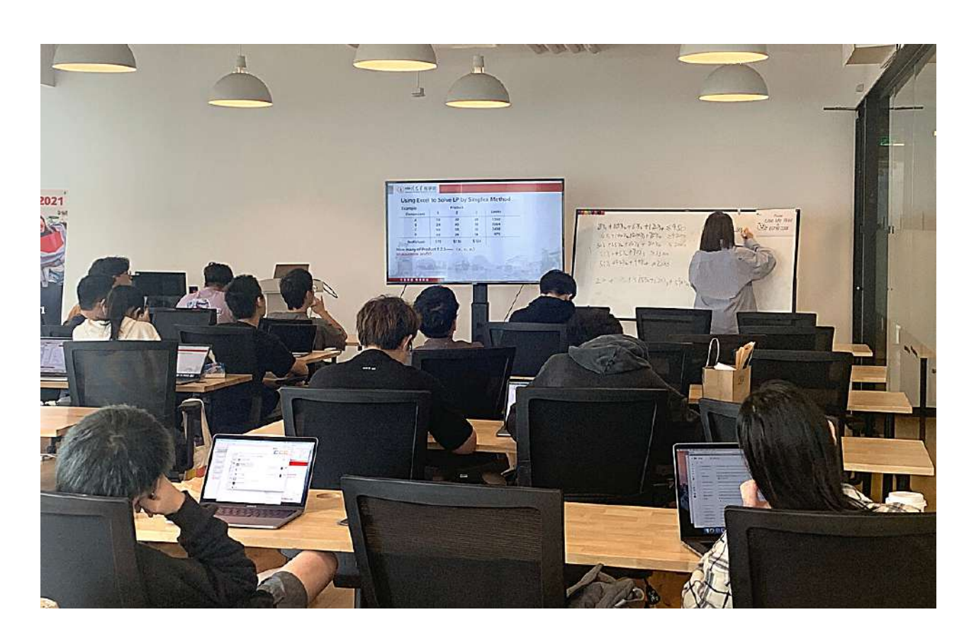
Business Analytics class

As we approach midterms this Fall semester, the Center has carried out a course diagnosis survey to collect students' feedback and comments on each course. This has been our regular practice at G-MEO since its establishment. The course diagnosis report shows that our students are really enjoying the classes we are offering this Fall!