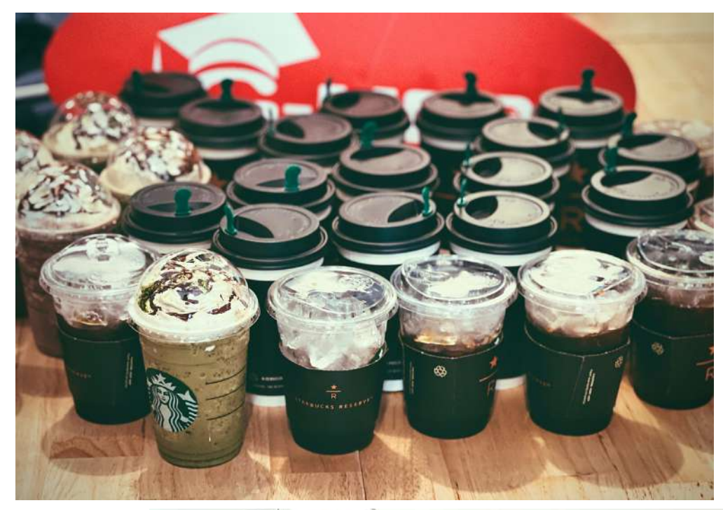
We prepared their favorite Starbucks drinks!

Some classes have been hosting their midterm examinations this past week. Our students have been working hard and trying their best to get good scores. With half of the semester finished, we hope our students have achieved some of their academic goals with G-MEO.