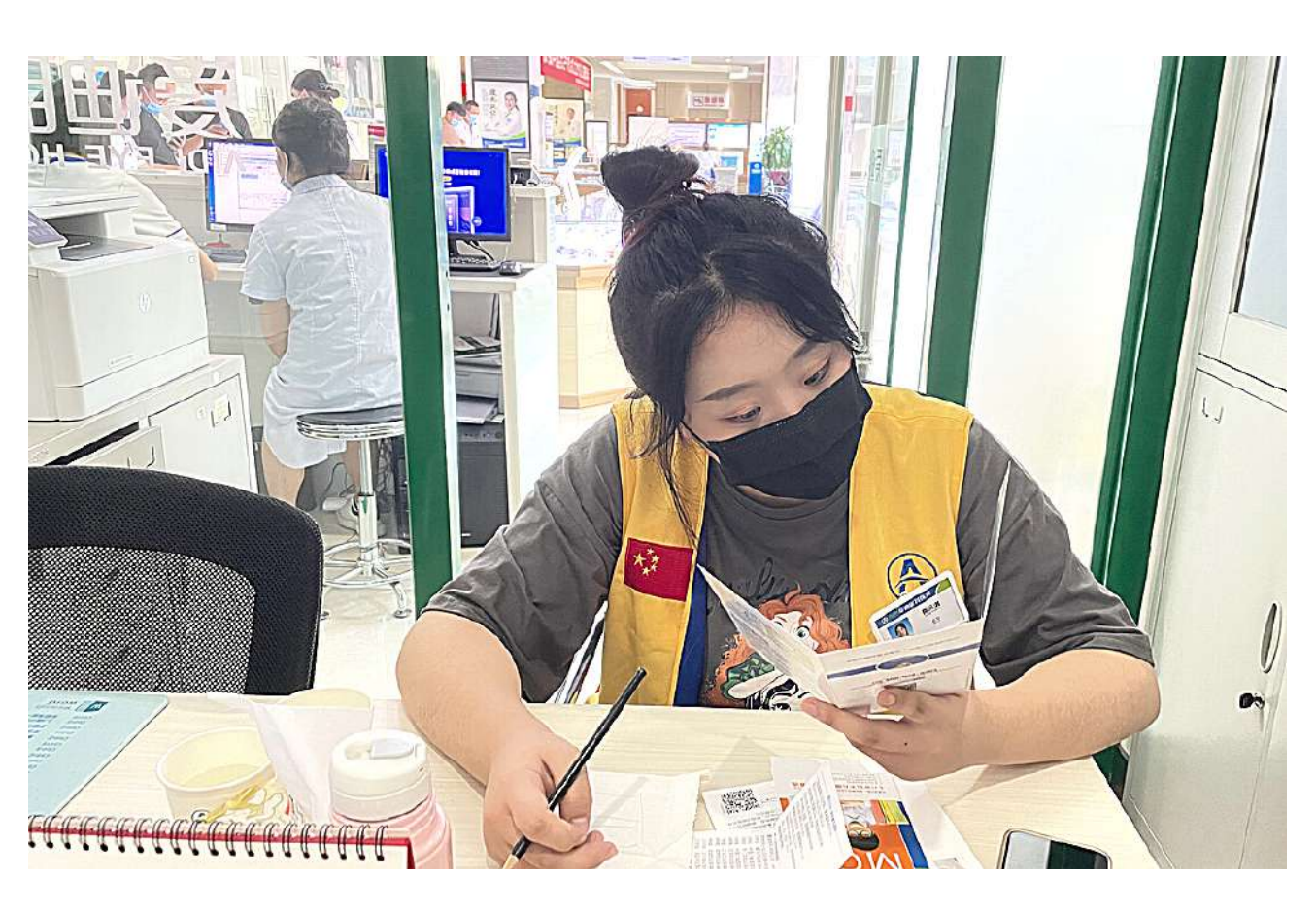
A student interning at an eye hospital in downtown Chengdu