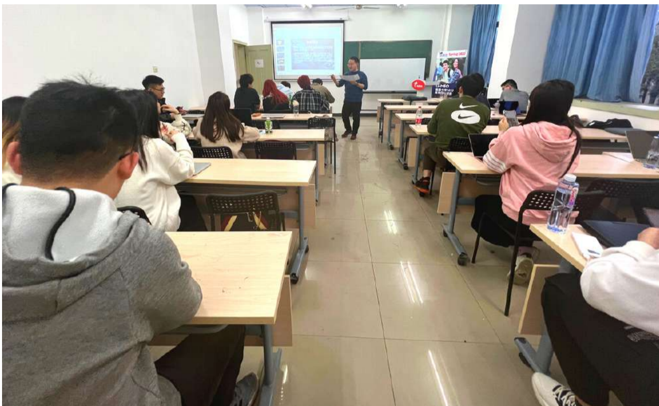
Students from Visual and Media Literacy class having in-person class in the third week