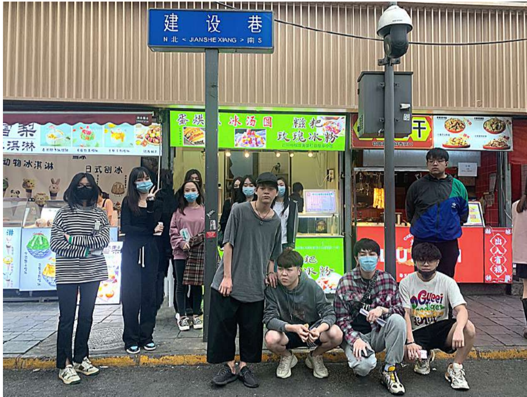
A stylish food tour group!