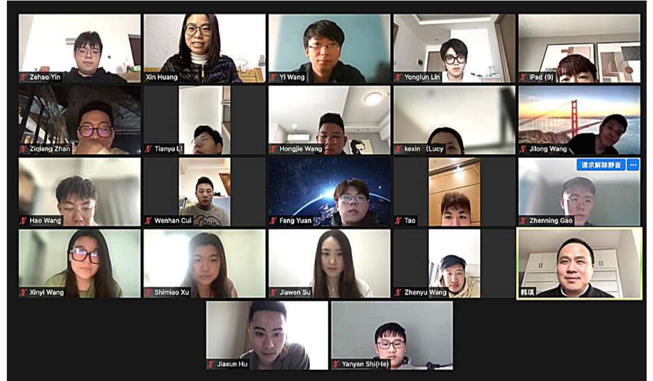
Special Topics: Corporate Finance class during the outbreak

After the onsite in-person orientation, Chengdu experienced a small outbreak of COVID 19 and classes had to be held online. Because of our experience holding classes online, this transition went very smoothly. Students were able to get back to campus for face-to-face class soon. All courses went well during the first three weeks.