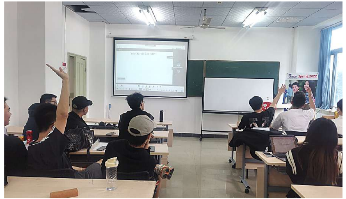
A very active class

It is always our obligation to offer the kind of education that not only meets the students' academic requirements but also their personal interests. In the first two weeks, the students were able to change their courses after participating and auditing different classes. Student course selections are all set now.