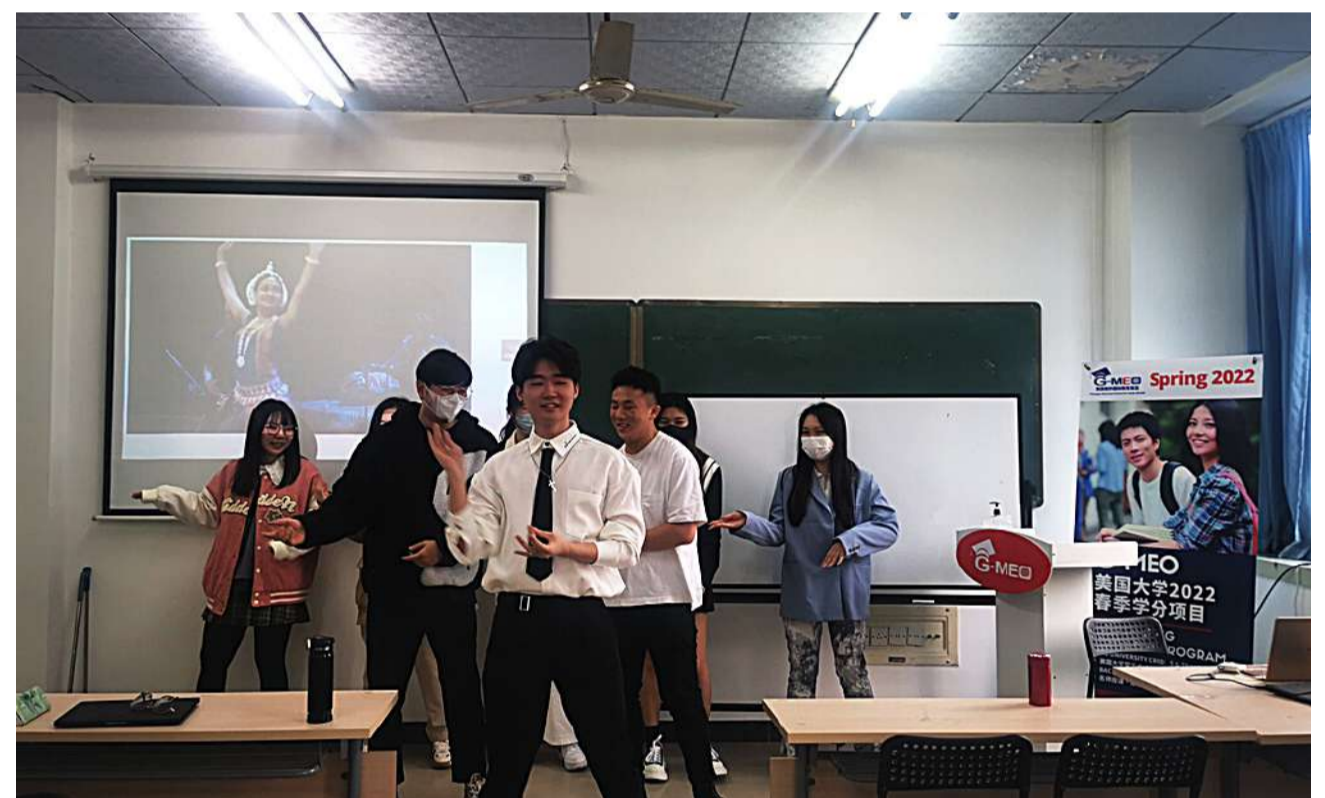
Students from World Music class giving group performance