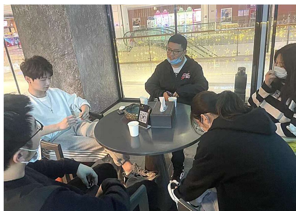
Group Three chilling before the game started