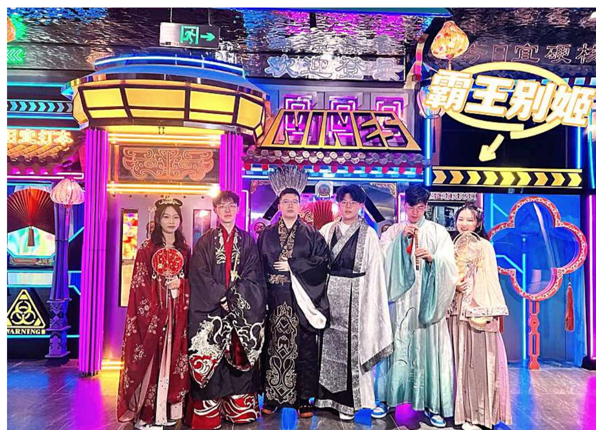
Looking at these fancy costumes and delicate makeup from Group One