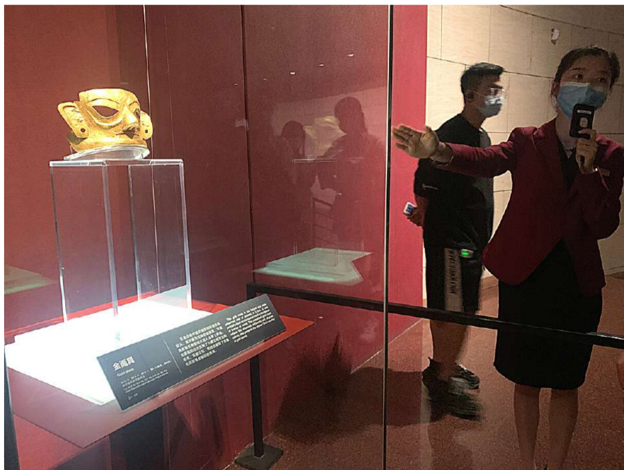
The tour guide introducing the gold mask and explaining its differences from the one unearthed at the Sanxingdui Site