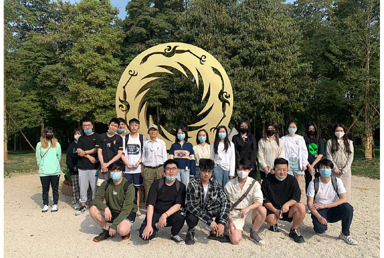
Group photo at the landmark of Jinsha Site Museum