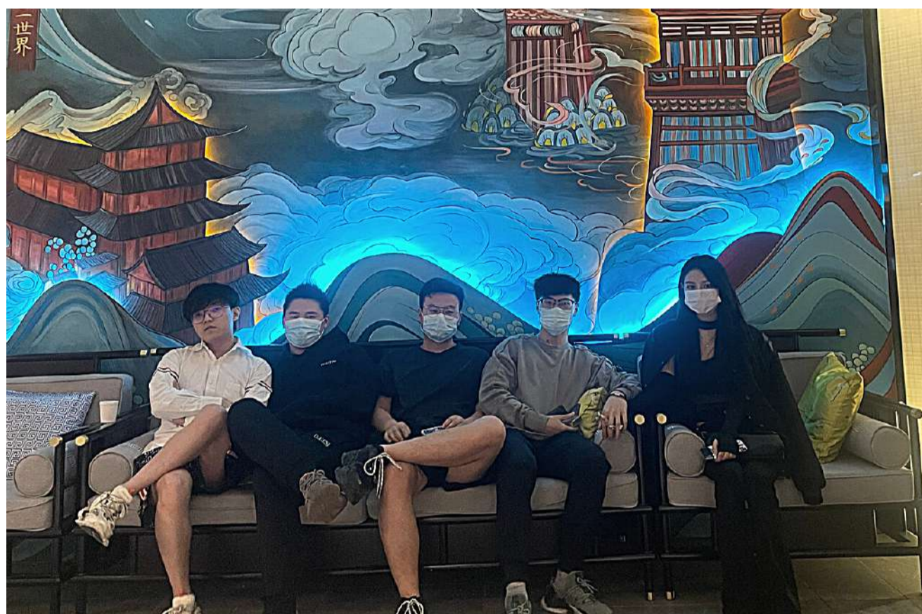
A stylish Group Two

Our students really enjoy participating in escape rooms, which is why we continue to arrange this activity for every semester/program. Along with the excitement the escape room brings, the high regard for this activity may be due to the changing scripts and settings in the different escape rooms. Some students went for hot pot after participating in the escape room to continue socializing with each other.