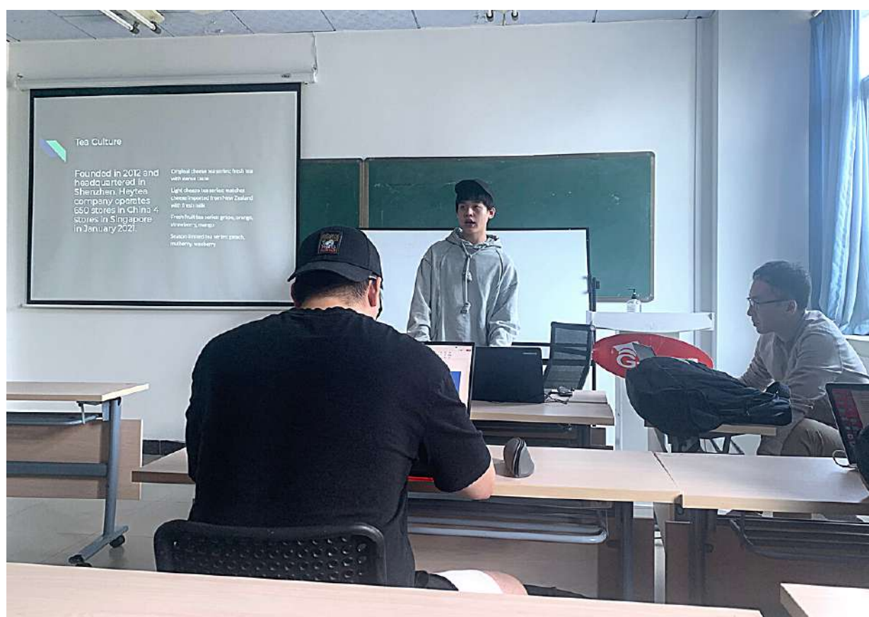
Students from Organizational Behavior class giving their final presentations