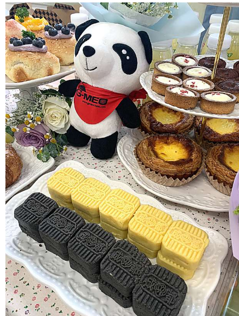
The special desserts prepared at the commencement