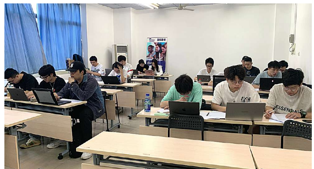
The Corporate Finance class taking an in-person open-book test