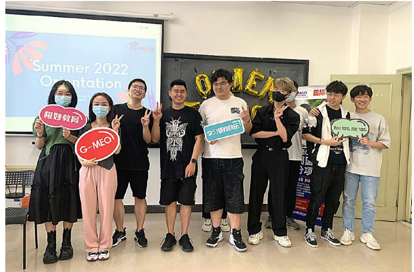
Students at the onsite orientation

This summer, the G-MEO Chengdu American Center welcomed 36 students from six different American universities. Nine courses covering topics including business, math, humanities, and internships are being offered. An onsite orientation was hosted during the first week when most students were able to attend. At the orientation, presentations on the program policy, faculty introductions, and information on Chengdu daily life were given. G-MEO's New York office held a virtual orientation for students who are taking online courses and participating in the virtual internship program.