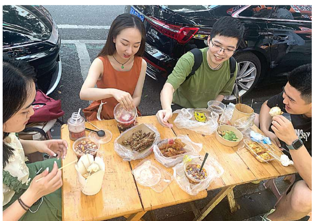
Lovely friends and delicious food!