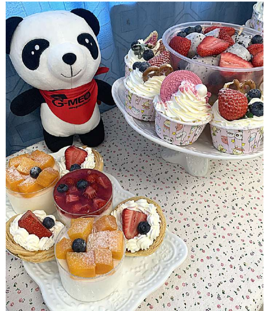
Small desserts prepared for the orientation