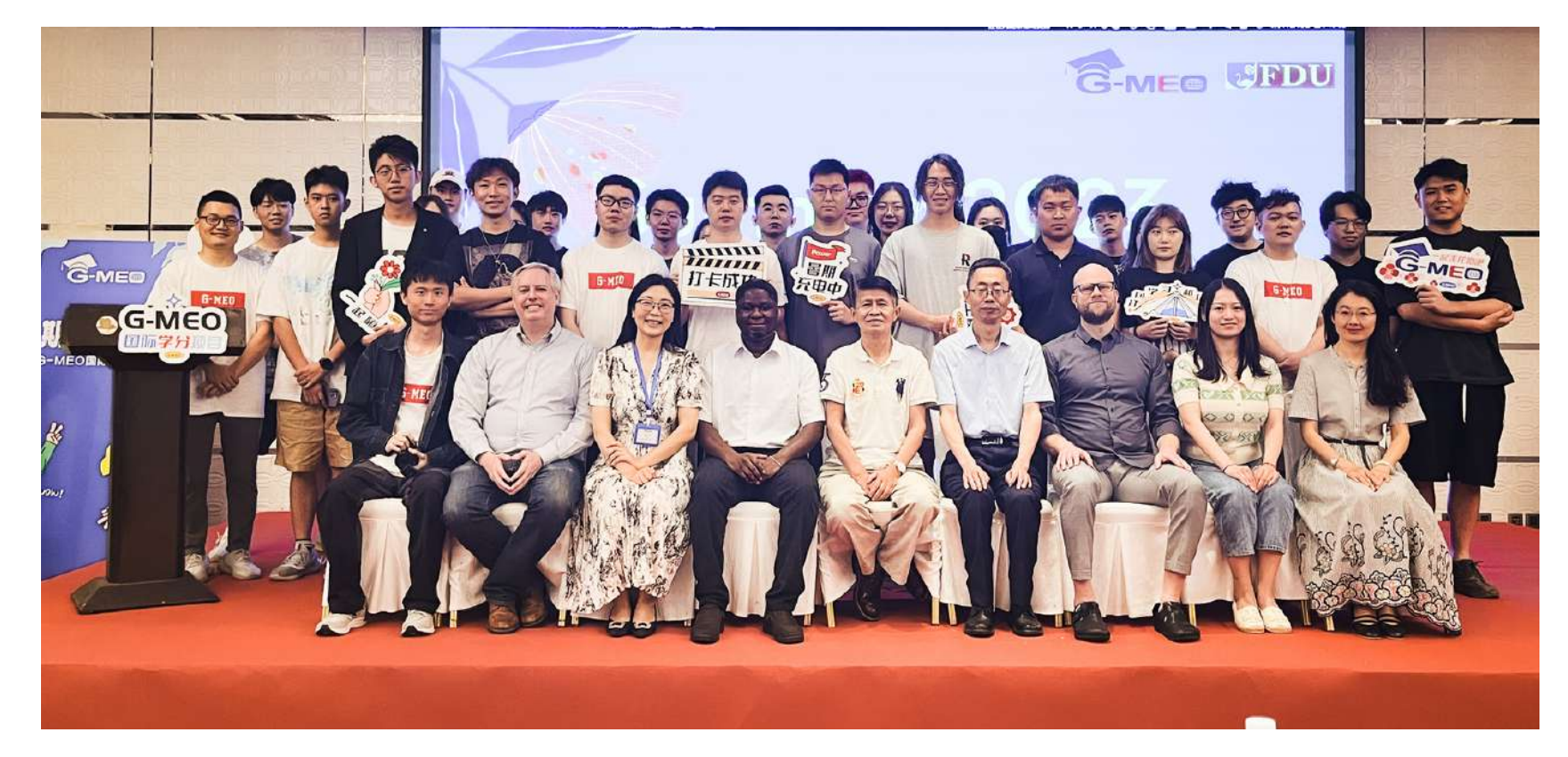
Welcome to G-MEO 2023 Summer Program!