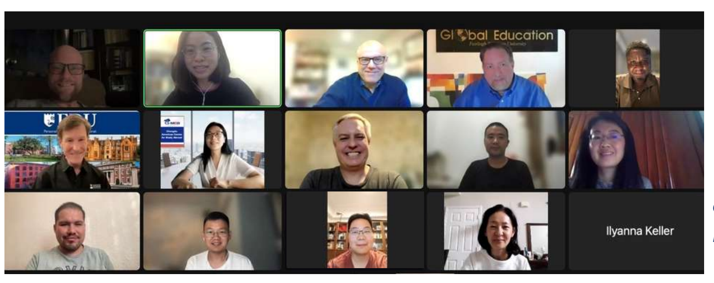
Welcome continuing and new faculty!