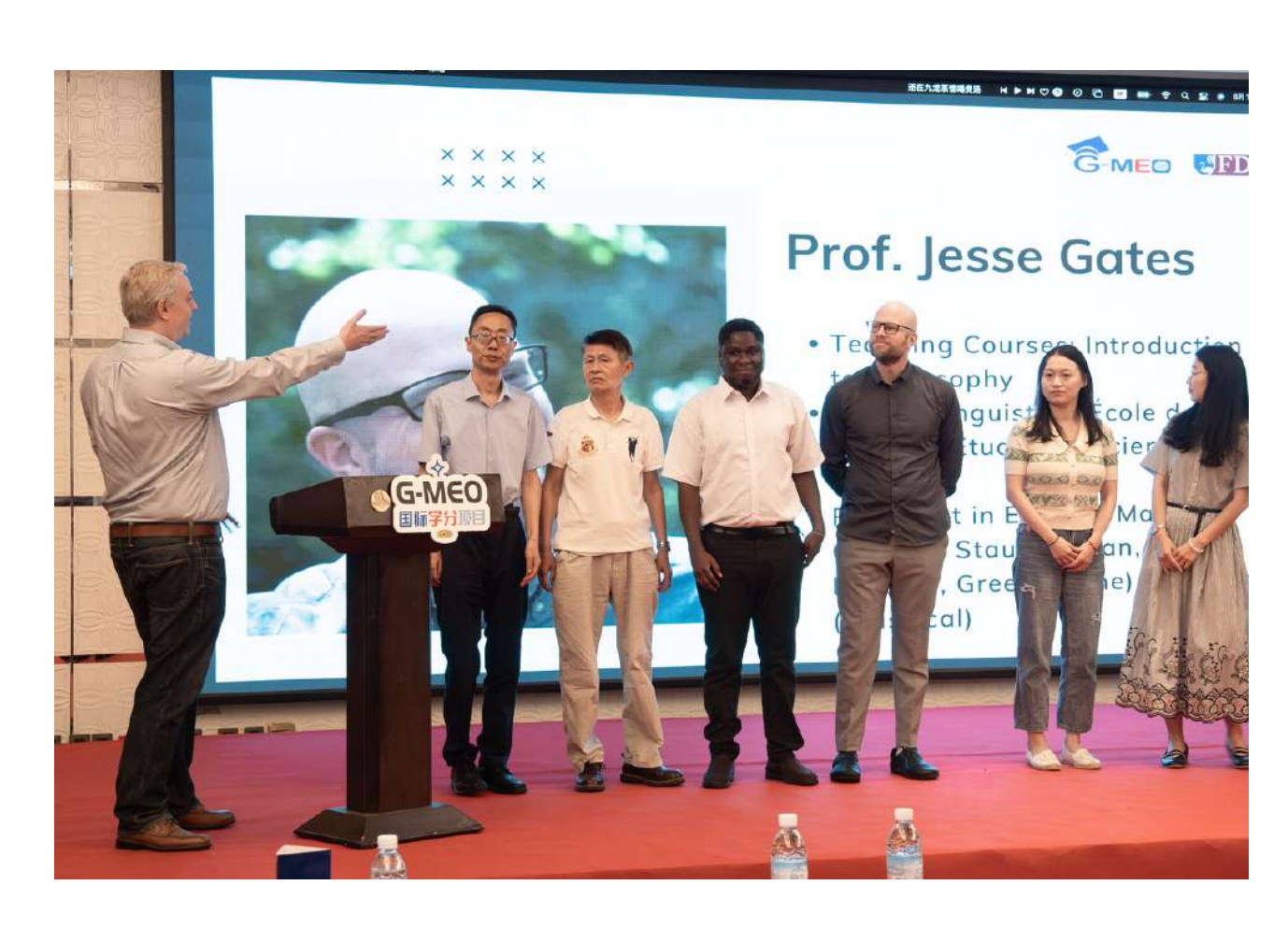
Faculty representatives at the on-site orientation