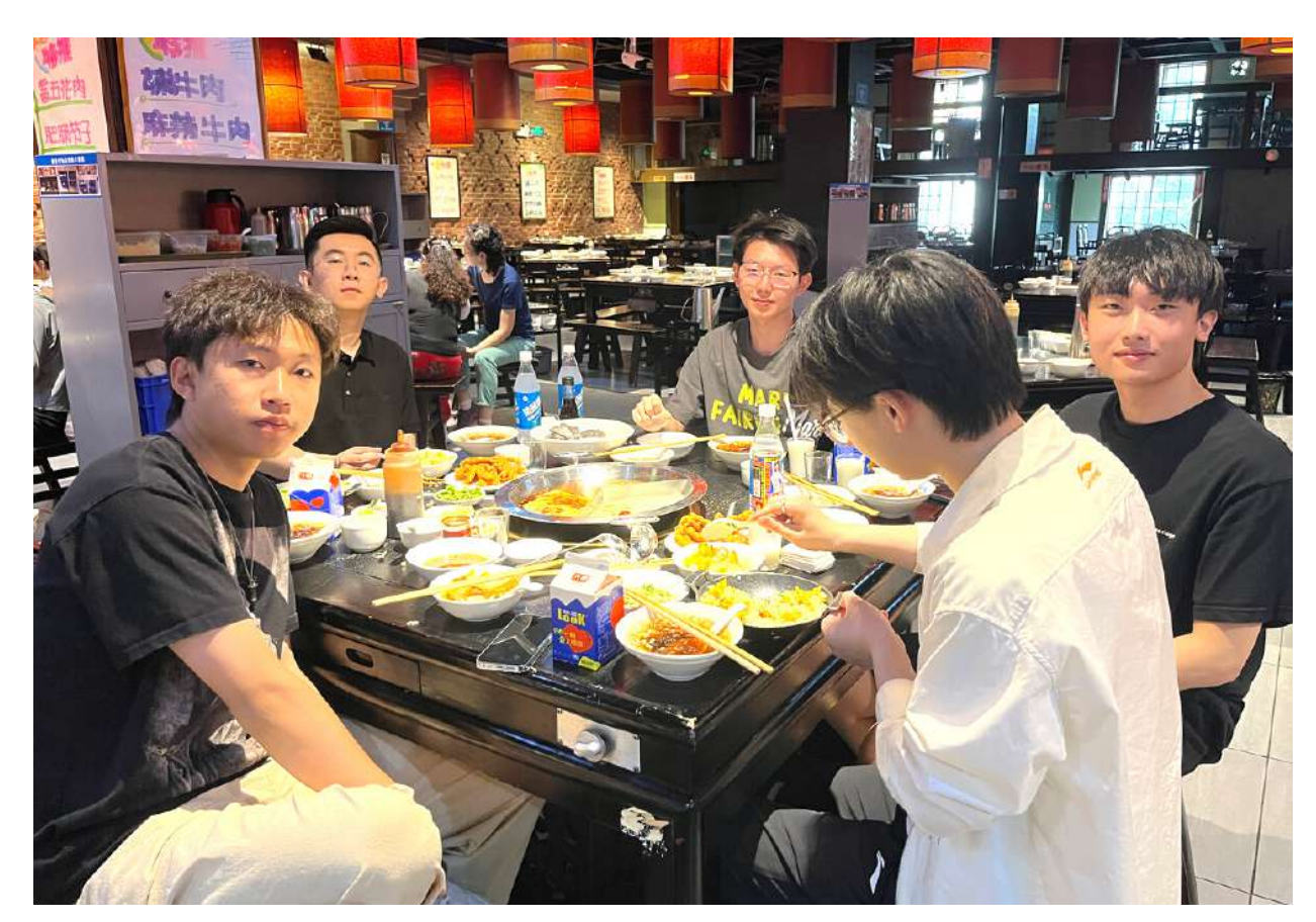
Students having hot pot

After the orientation, students gathered at a nearby hot pot restaurant to enjoy some authentic Chengdu hot pot. As most of our students come from other provinces and cities outside of Chengdu, eating hot pot is always on the top of the to-do list if you are new here. The students really got to experience how spicy but tasty the food here is. Everyone had a great time eating and socializing.