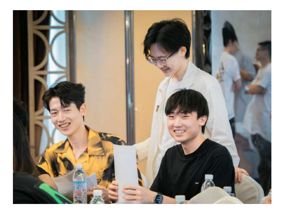
Students at the on-site orientation