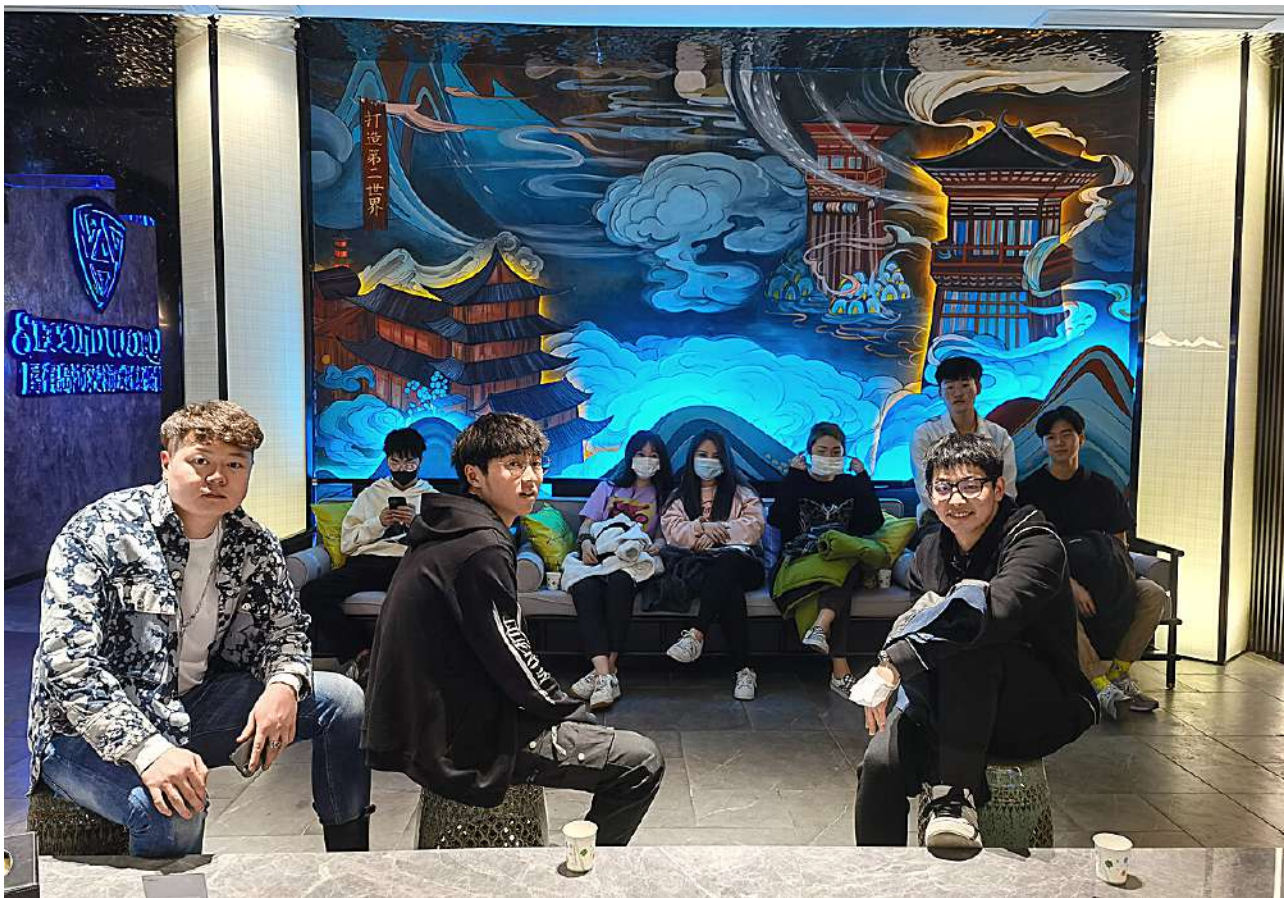
Brave and charming!