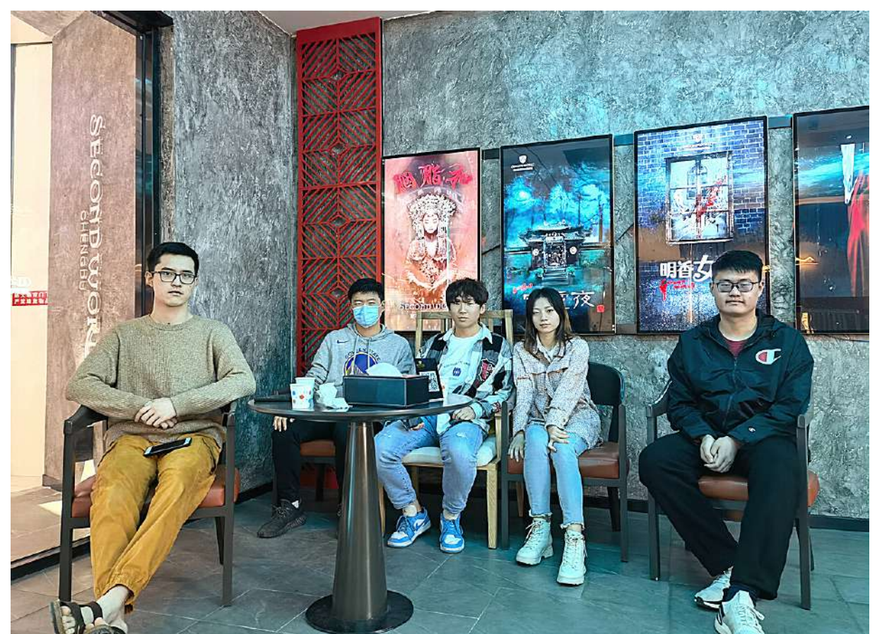
Young and smart!