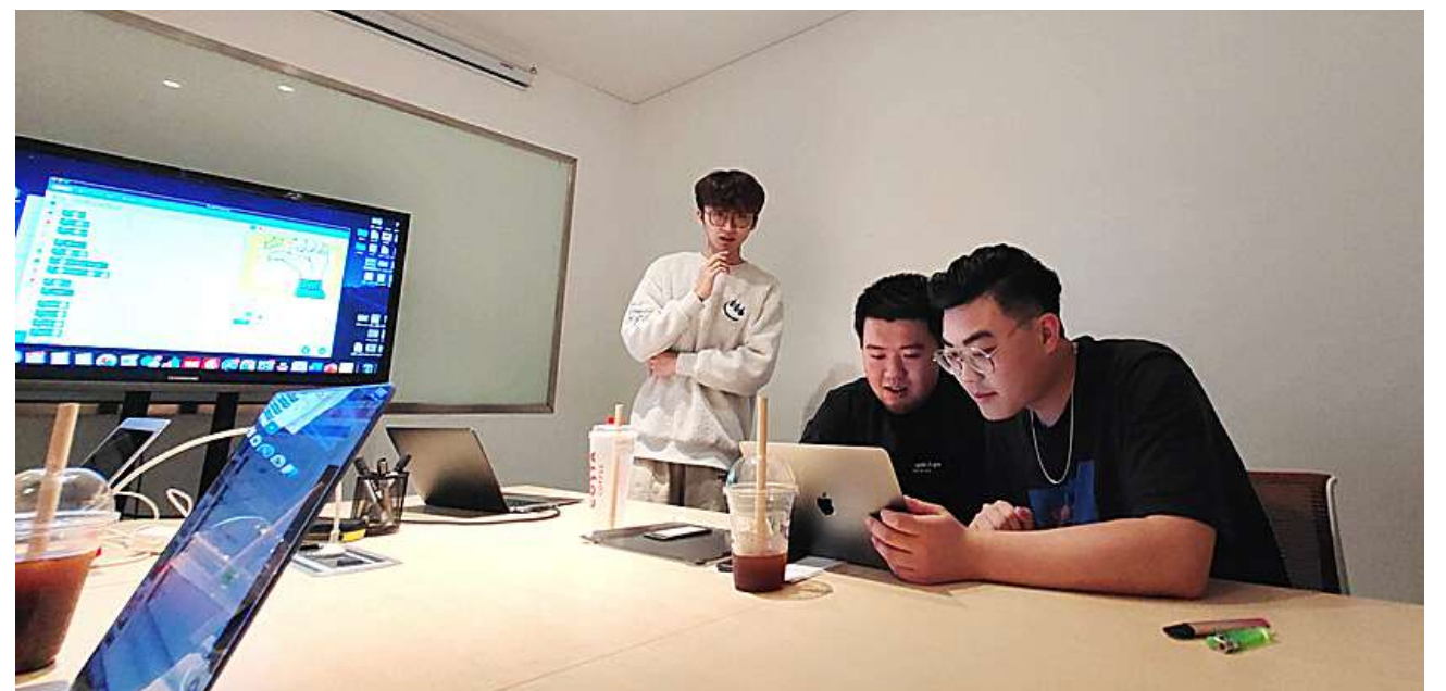
Teamwork at internship