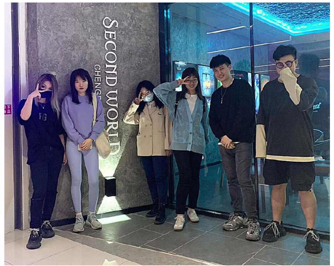
We all escaped!

When talking about fun activities young people enjoy these days, escape rooms should definitely be listed. Confined to a room or other enclosed setting, game players are given a set amount of time to find a way to escape. Such games usually call for cleverness, energy, and even courage. Last weekend, our students formed groups and went to a famous local escape room to enjoy this exciting game!