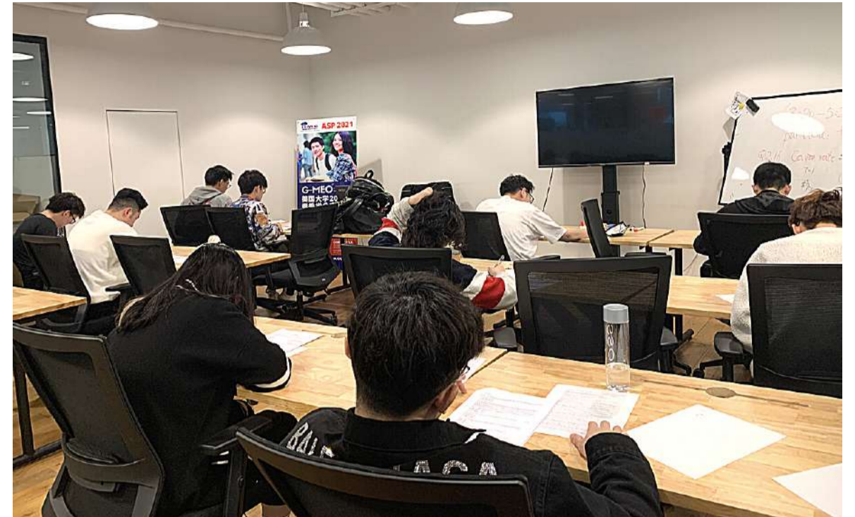
Students from the Money, Banking, and Finance class taking their mid-term exam