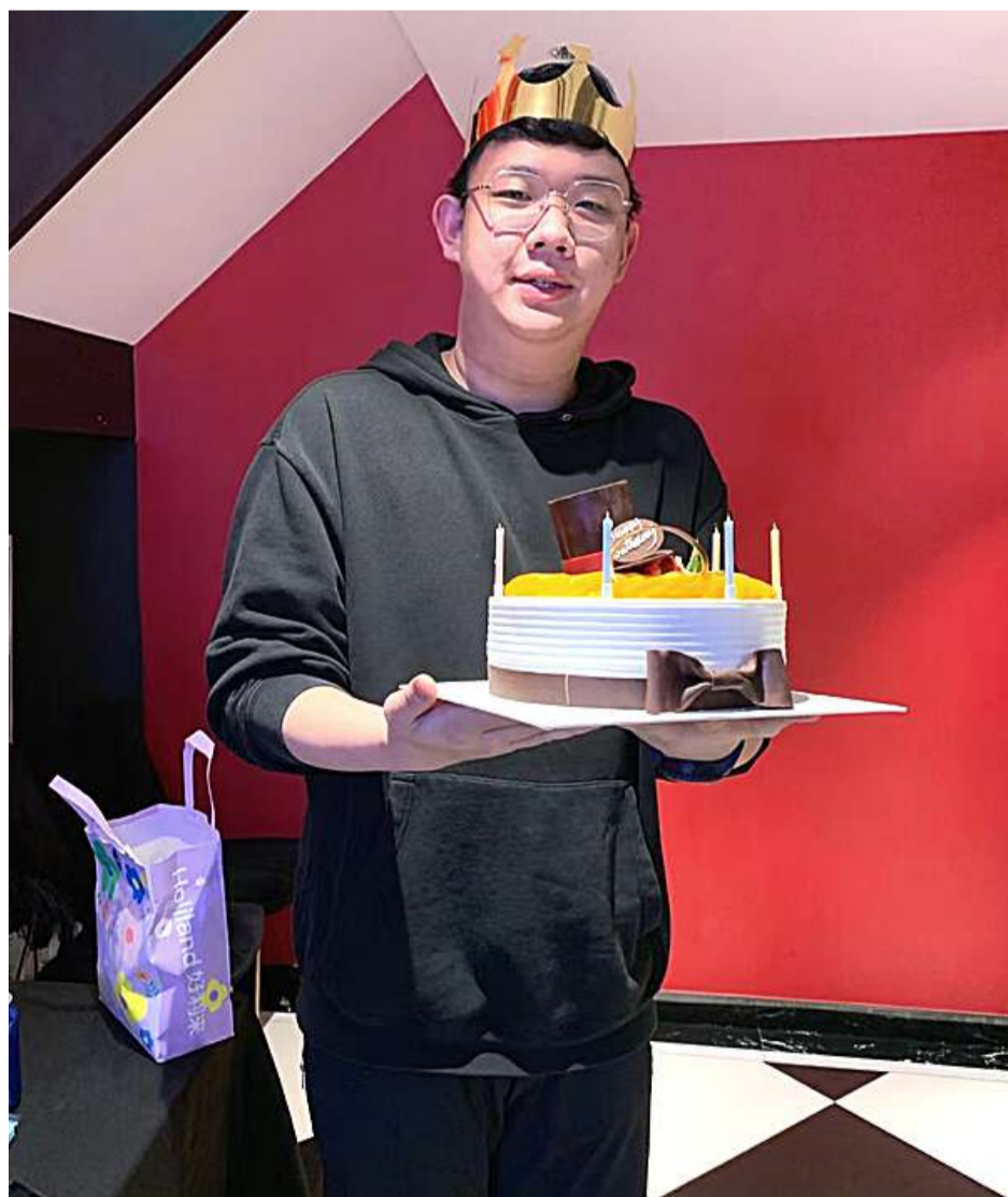
A special birthday celebration at G-MEO