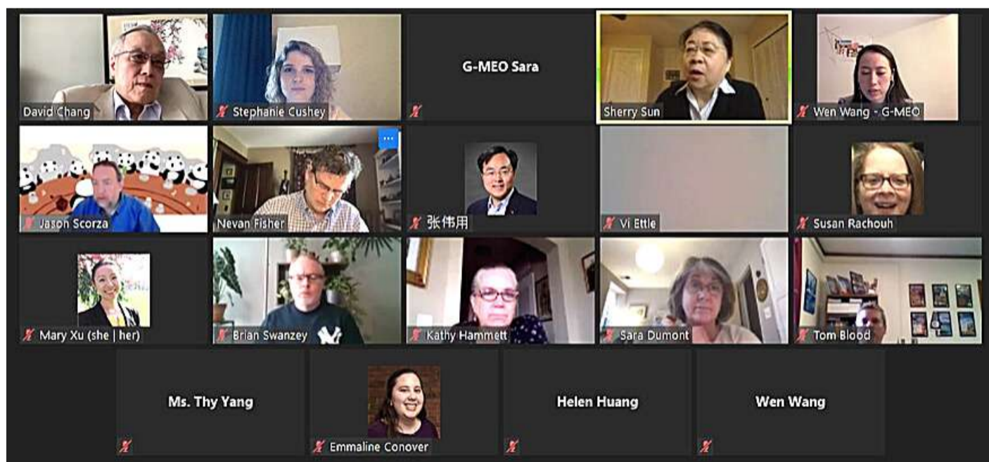
Meeting with representatives from partner universities