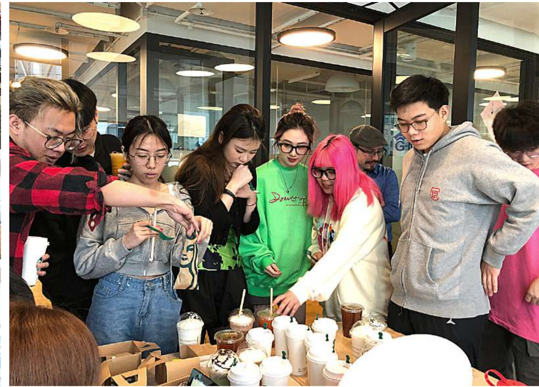
So many and so hard to choose!