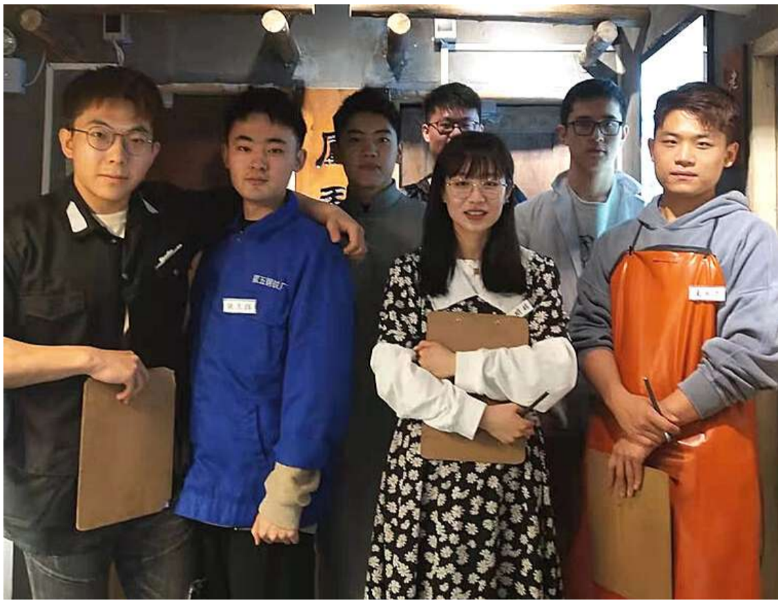
The first group of students went to an immersive venue and even changed costumes!