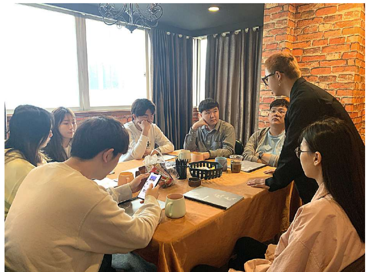
The host introducing the scripts to the second and third groups