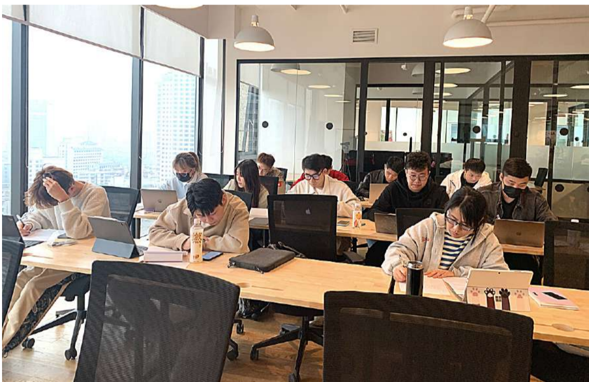
Mid-term for the International Business Finance class

The students recently took their mid-term exams in the past couple of weeks. They have been working hard and trying their best to get good grades. With half of the semester finished, we hope our students have achieved some of their goals and have been enjoying their time with G-MEO.