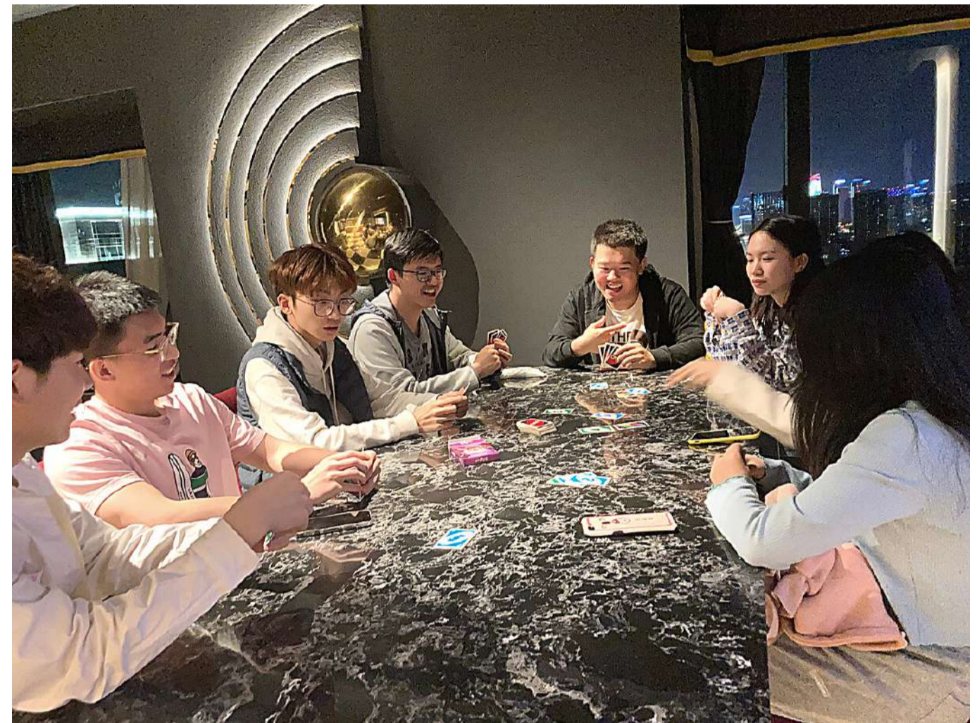
Majhong and board games!